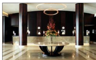
Novotel Hotel, Dubai