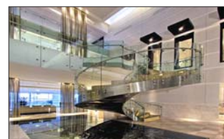
Hyatt Regency, Dubai