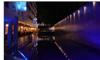
The Park, Bengaluru