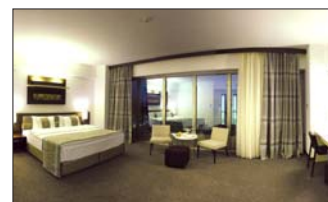
The Leela Palace, Mumbai