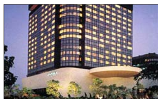
Le Meridien, New Delhi