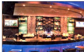
Taj Residency (Ice Bar), Bengaluru