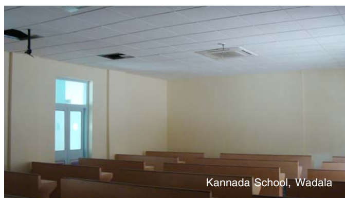
Kannada School, Wadala