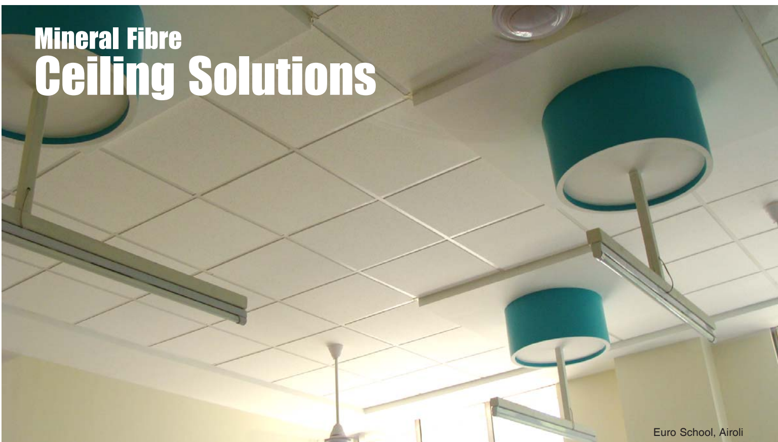
Euro School, Airoli

Anutone adds its solutions portfolio for white grid ceilings with the induction of Mineral Fibre Tiles from Saint Gobain.