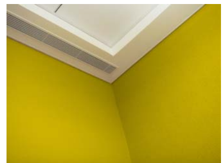
AnutoneSubtex ceilings with diffused uplighting and AnutoneSmery walls with precise colouration provide the right visual environment so crucial for Telepresence Rooms. Of course, acoustics is assured ... after all, it is our middle name!