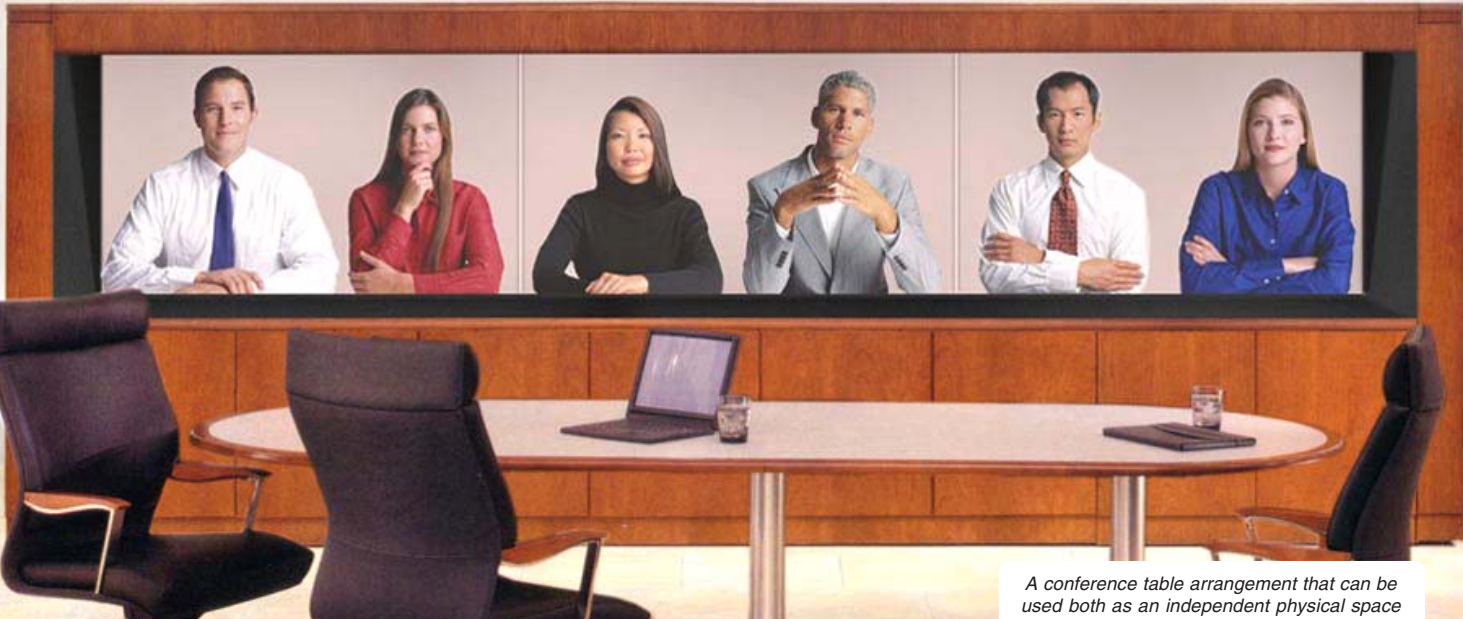
A conference table arrangement that can be used both as an independent physical space for normal meetings or linked virtually via telepresence with large screens in the cabinetry to conduct business with several remote locations simultaneously in real time

Telepresence is a hot topic today given its benefits of life-like conferencing obviating the need for travel; the resultant savings being costs and carbon emissions. Anutone detected its potential ahead of time and published a leader in Acoustic Answers Nov-Dec 2006 . Anutone, today, offers complete wall and ceiling solutions for Telepresence Rooms ensuring single-source turnkey responsibility.