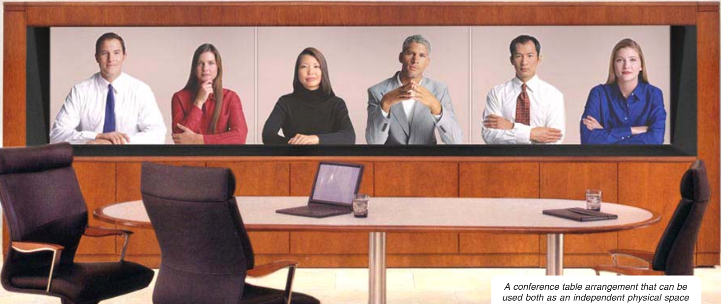
A conference table arrangement that can be used both as an independent physical space for normal meetings or linked virtually via telepresence with large screens in the cabinetry to conduct business with several remote locations simultaneously in real time

Telepresence is a hot topic today given its benefits of life-like conferencing obviating the need for travel; the resultant savings being costs and carbon emissions. Anutone detected its potential ahead of time and published a leader in Acoustic Answers Nov-Dec 2006 . Anutone, today, offers complete wall and ceiling solutions for Telepresence Rooms ensuring single-source turnkey responsibility.